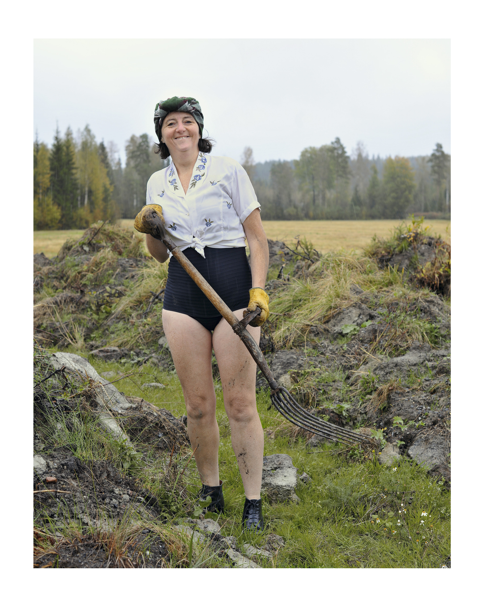
Fig. 04287KEL (TM) G. A. Serlachius Oy's workers at Loukkusuo peat bog. One Woman. 1943 / 2015. Mänttä, Finland, from Ten People in a Suitcase, 2015

As she writes: Each character I chose to re-imagine had something about them that I recognised. I felt there was a part of me already within the photograph. It could have been the way the character stood, or the space they took up in the frame, a glint in the eye, or an authority in the angle of the hand. I felt a visceral connection to them. In order to create these new photographs, I had to imagine the events that led up to this moment in the character's lives, and in doing so, felt closer to the town itself.