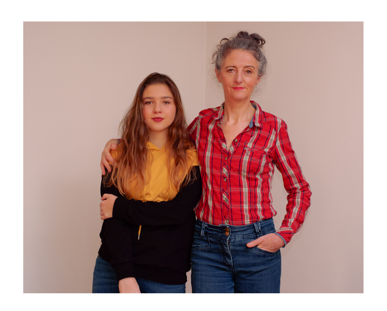
30th March 2019, from The Maiden and the Crone, 2017 –

Presented as a grid, the photographs can be read as a record of the evolving relationship of mother and daughter over time, while the act of making them marks both a parental desire to freeze the moment and the commitment mother and daughter have made to one another over this period.