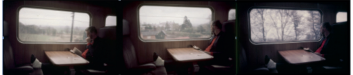
Series of portraits taken on the intercity train between Belfast and Dublin (know as the Enterprise), January, 1976