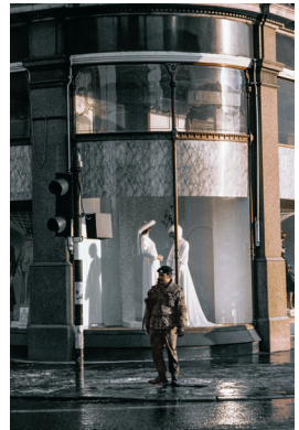
British soldier on duty on Royal Avenue, Belfast, Northern Ireland, c. 1970