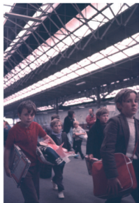
Refugees arriving in Heuston Station, Dublin, Ireland, 1969