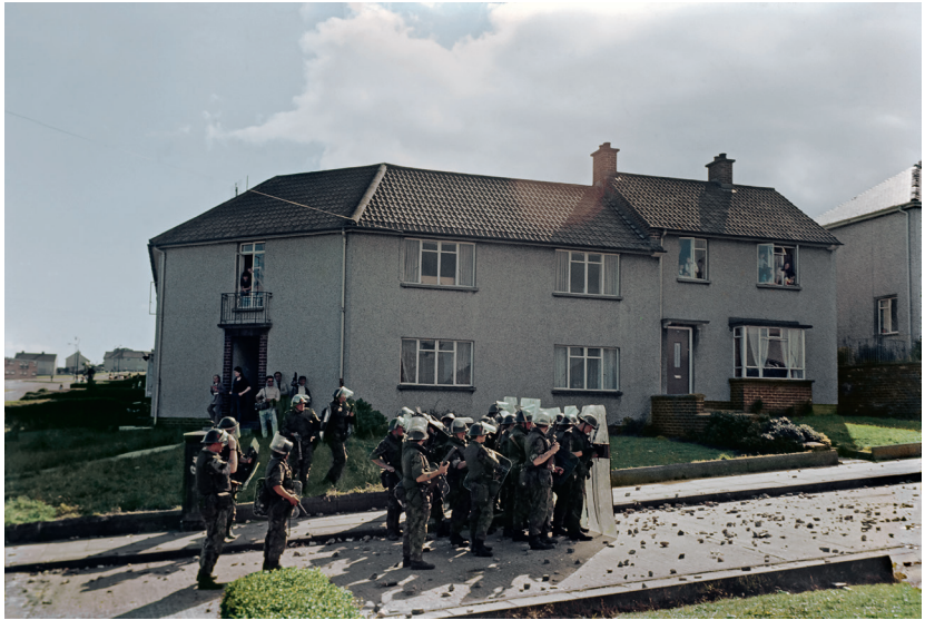
British soldiers in riot gear during a protest, Creggan Estate, Derry city, Northern Ireland, c. 1970