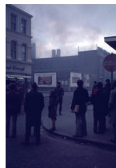
Aftermath of a bomb explosion, Belfast, Northern Ireland, c.1970