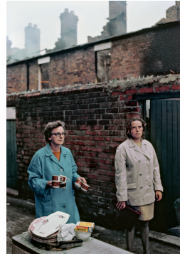
Local women standing near their burnt-out homes, Bombay Street, West Belfast, Northern Ireland, 1969