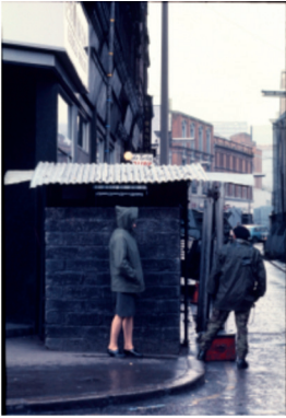
Ring of Steel checkpoint, Belfast city centre, Northern Ireland, 1970s