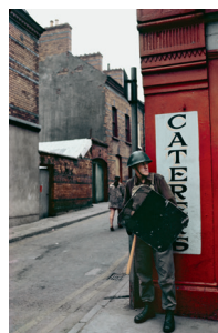
British soldier, Belfast, ca. 1969.