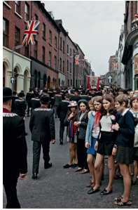
Crowd watching members of the Orange Order marching in a Twelfth of July parade, Derry city, Northern Ireland, c. 1969