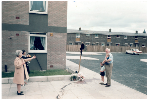
Local people the site where Seamus Cusack was killed, Bogside, Derry city, Northern Ireland, 1971