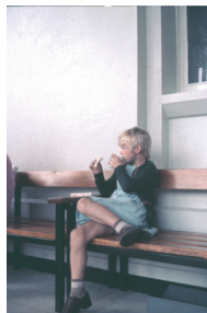
Young girl in Heuston train station, Dublin, Ireland, c.1969