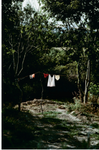
Clothesline, Ireland, c. 1978