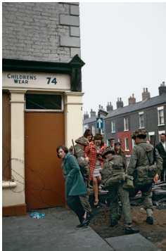
Women crossing through British Army barricade, Northern Ireland, 1969

Okamura travelled to Belfast in time to witness the unfolding sectarian violence that erupted in parts of the city when Loyalist mobs, abetted by the police, attacked several Catholic neighbourhoods. Seven people were killed, hundreds wounded, and over 1,800 families were evacuated as entire streets were set on fire.