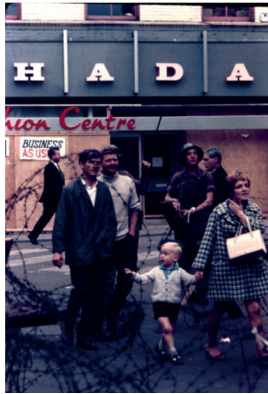
Family pass British Army barricade, Derry City, Northern Ireland, 1969