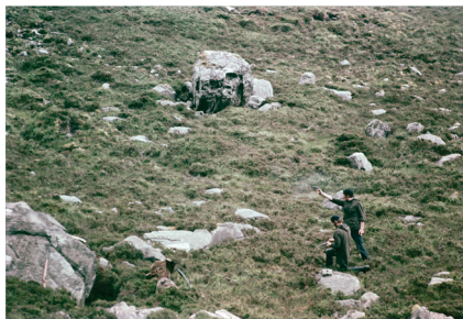
IRA training exercise, unknown location, Ireland, 1970s