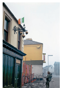
Soldier at corner, Derry City, Northern Ireland, c. 1969