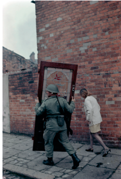
British soldier carrying a door, Bombay Street, West Belfast, Northern Ireland, 1969