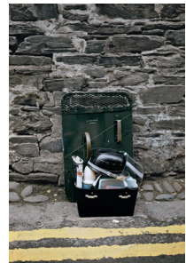
RUC police riot gear, Derry city, Northern Ireland, c. 1969