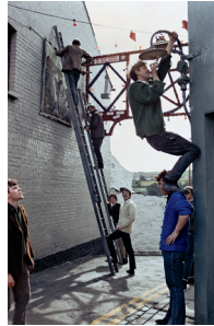
Preparations for the Twelfth of July celebrations in the Fountain area, Derry city, Northern Ireland, c. 1969

Okamura was in Derry city for the loyalist Apprentice Boys March on 12 August 1969 when rioting erupted after the parade passed close to the Bogside. Three days of intense street battles between the police and youths from the Bogside and Creggan housing estates culminated in a small victory for the locals, who famously proclaimed the area "Free Derry". Known as 'The Battle of the Bogside', this outbreak of violent resistance marked the beginning of the "Troubles". Okamura's photographs offer us a unique perspective on this moment in history, eschewing narrative to offer instead a more open-ended, subjective account.