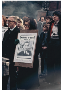
Woman carrying a poster of Frank Stagg at a Republican march, Northern Ireland, 1970s. Stagg was an IRA combatant from County Mayo who died in Wakefield prison, England, after sixty-two days on hunger strike in 1976.