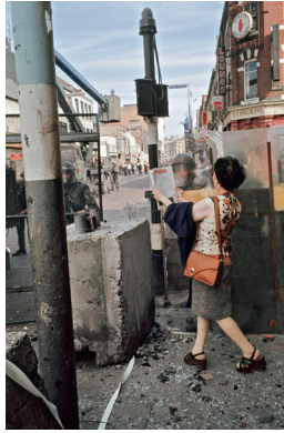
Woman at a British Army barricade, King Street, Belfast, Northern Ireland, c. 1970