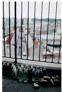
Emptied milk bottles and rocks ahead of riots, Rossville Flats, the Bogside area, Derry city, Northern Ireland, c. 1969