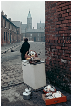
Household belongings on the street following the attack on Bombay Street, West Belfast, Northern Ireland, 1969

Unlike other representations of the North of Ireland at this time, Okamura's photographs are almost all in colour, remarkably out of sync with the conventional, black-and-white, 'heroic' representations that came to define this period in Irish history.