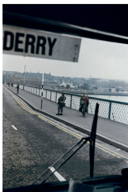
Craigavon Bridge over the River Foyle, viewed from a bus, Derry city, Northern Ireland, c. 1969