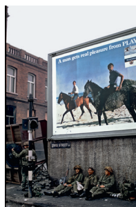
British soldiers resting at a wall, Divis Street, West Belfast, Northern Ireland, c. 1969