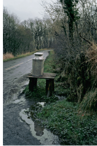
Milk churns awaiting collection, Northern Ireland, 1970s