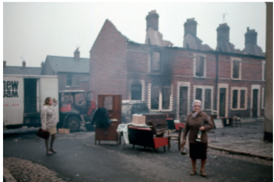
Local women standing beside their household belongings near their burnt-out homes, Bombay Street, West Belfast, Northern Ireland, 1969