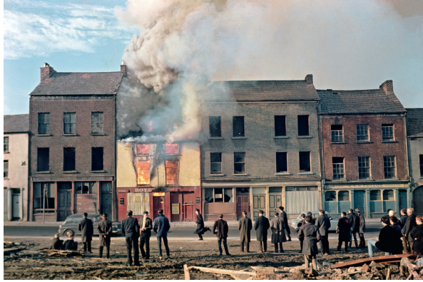
Burning building, Derry city, Northern Ireland, c. 1969