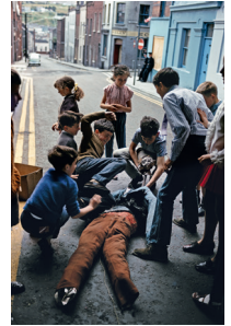
Children preparing an effigy of Lt Col Robert Lundy, Derry city, Northern Ireland, 1970s. Lundy was Governor of Derry reviled by Ulster loyalism as a traitor during the Siege of Derry in 1688. An effigy of Lundy is burnt at the end of the annual Apprentice Boys' Parade in August in Derry, c. 1969