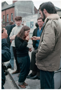
Civil rights activist and MP Bernadette McAliskey with fellow activists during the Battle of the Bogside, August 1969.