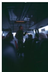
British Soldier inspecting a bus, Northern Ireland, c 1970s