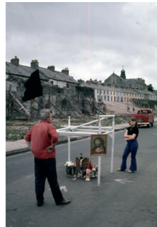
Local people at the street memorial on Lecky Road, Bogside, Derry city, marking the site where Desmond Beattie was shot and killed by the British Army, Northern Ireland, 1971