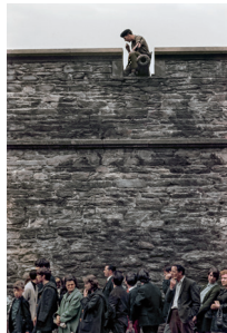
British soldier observing a crowd from Derry city walls, Northern Ireland, c. 1969