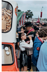
Young band member at a Twelfth of July parade, Derry city, Northern Ireland, c. 1969