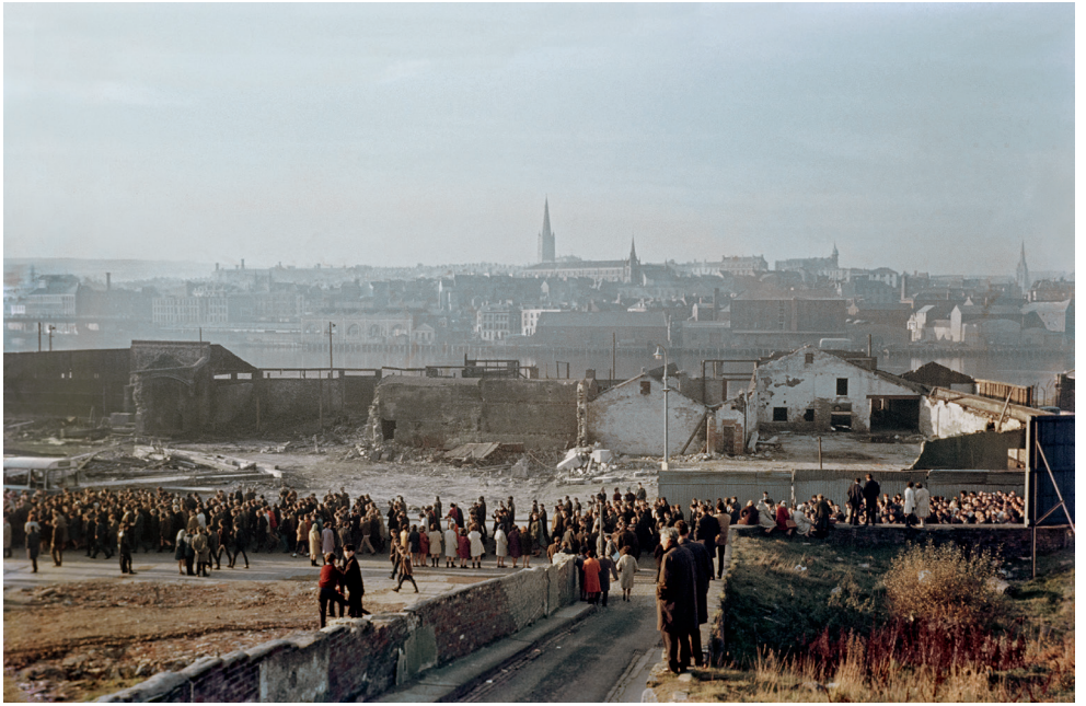
Crowd of people assembling in the Waterside area of Derry city, Northern Ireland, 1969