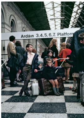
Family in Heuston train station, Dublin, Ireland, c. 1969