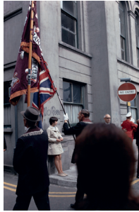
Woman at a street corner during an Orange Order march, Derry city, Northern Ireland, c. 1969