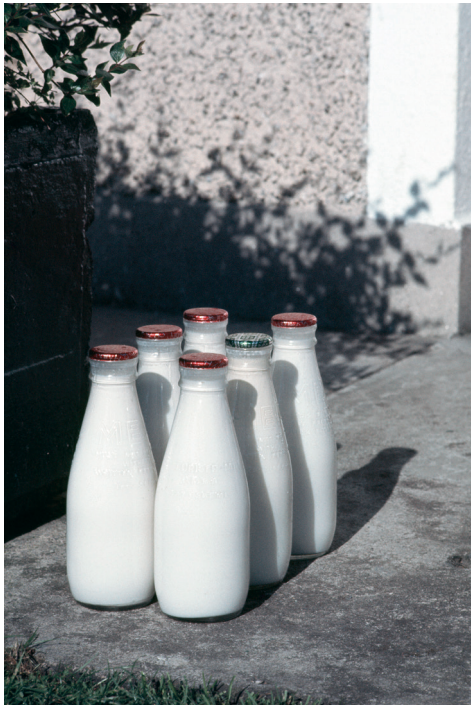
Milk bottles on doorstep, Ireland, 1970s