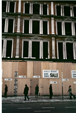
Bombed-out building, Belfast city centre, North- ern Ireland, 1970s