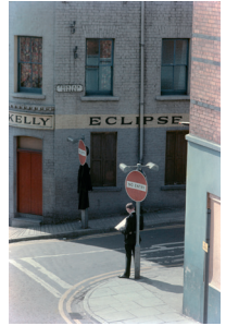
Fountain Street, Derry city, Northern Ireland, c. 1969