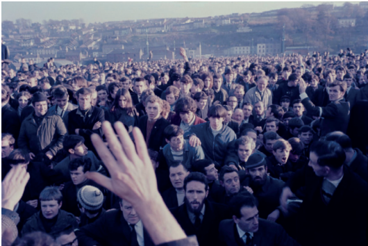
Crowd at a Civil Rights Protest March, Derry, Northern Ireland, c. 1969